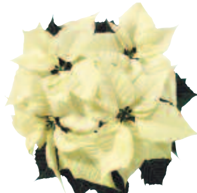
'Christmas Feelings White'