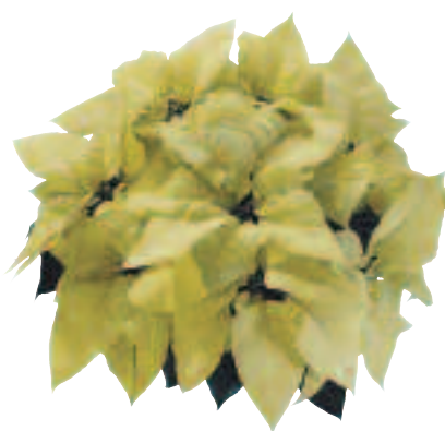
'Christmas Dream Vanilla'