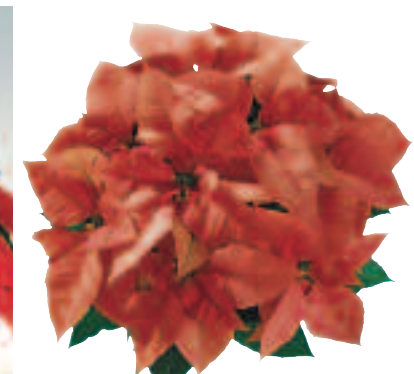
'Christmas Dream Pink'