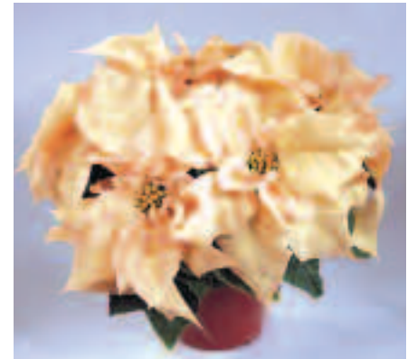
'Visions of Grandeur'

'Winter Rose Early Pink' (Ecke Ranch, formerly 19-04). A good addition to the new Winter Rose Early series, 'Winter Rose Early Pink' has medium-pink bracts that curl under in typical Winter Rose fashion. The older bracts fade to pale pink, and the pink/green transition bracts are rather prominent. As with 'Winter Rose Early Red', lateral shoot development is excellent, and plants are very uniform. 'Winter Rose Early Pink', like others in the Winter Rose Early series, tends to be shorter than 'Winter Rose Dark Red' and requires less growth regulator. For 6½-inch pots add one (South) to three (North) weeks of long days after the pinch to your normal schedule. This cultivar will probably be most useful for growers producing 'Winter Rose Early Red'.