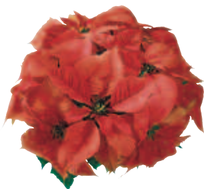
'Christmas Feelings Pink'

'Christmas Feelings Jingle' (Selecta First Class). 'Christmas