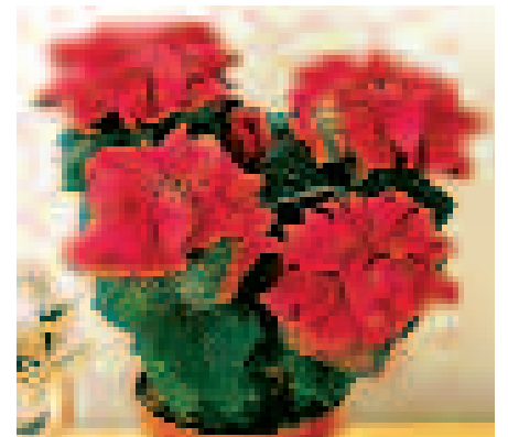
'Winter Rose Early Pink'