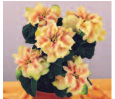
'Winter Rose Early Marble'

'Winter Rose Early Marble' (Ecke Ranch, formerly 20-04). Another cultivar in the new Winter Rose Early series, this one has a light pink center and creamy pink edge. Older bracts tend to show a lot of green in the creamy edge. The growth characteristics are similar to 'Winter Rose Early Pink' described above. GPN